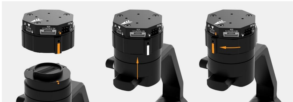
Fig. 7.2. Gimbal attachment using hyper quick release mechanism.