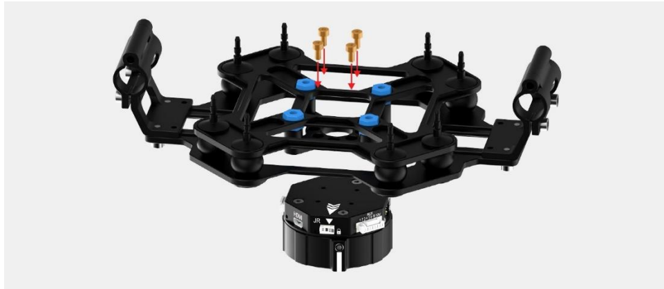
Fig. 7.1. Hyper quick release mechanism installation.

Mount the top part of the hyper quick release onto the frame or damping isolator on the drone (Fig. 7.1). Insert and twist the gimbal portion of the hyper quick release into the top part (Fig. 7.2). Reverse to disconnect. Setup and wiring details available in the MSDC Manual.